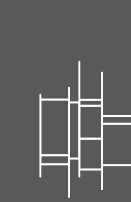
Randomito L 81.6 D 20 H 96