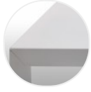
Goffered matt painted white X124