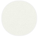
Matt lacquered white X042