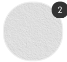
HPL Mass Colour