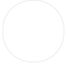
White resin X039