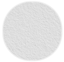
HPL mass colour white