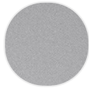
Matt painted aluminium X059