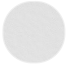
Matt painted white X057