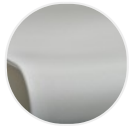
matt white polyethylene