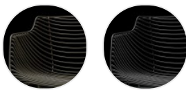
Matt painted bronze X100 Matt painted black nickel X101