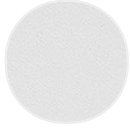
Matt painted white X053